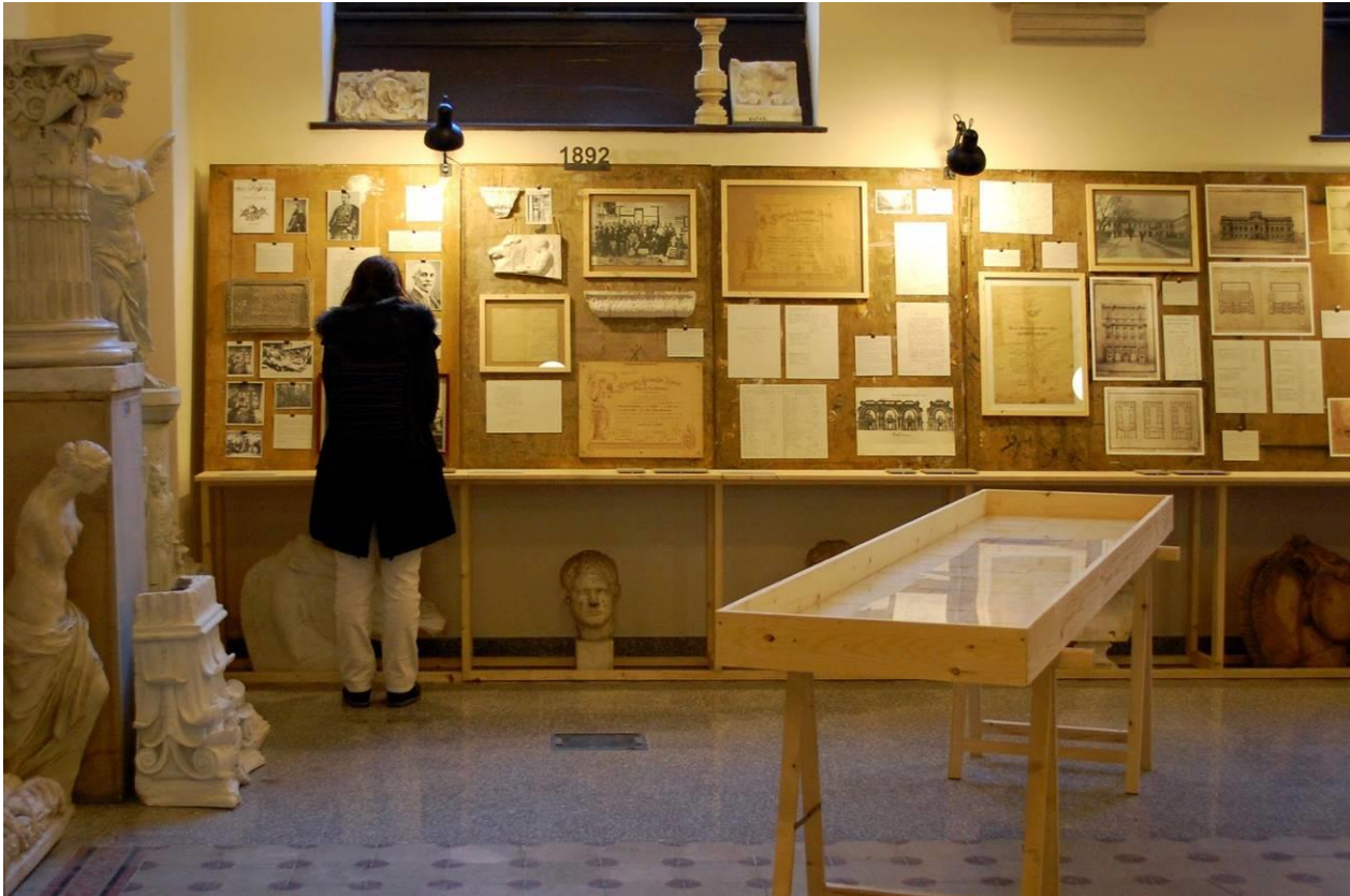
Museum of the Ion Mincu University of Architecture and Urbanism - Bucharest