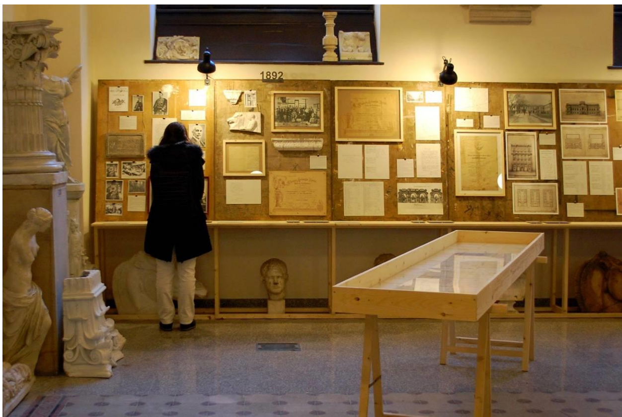
Ion Mincu University Museum - Bucharest