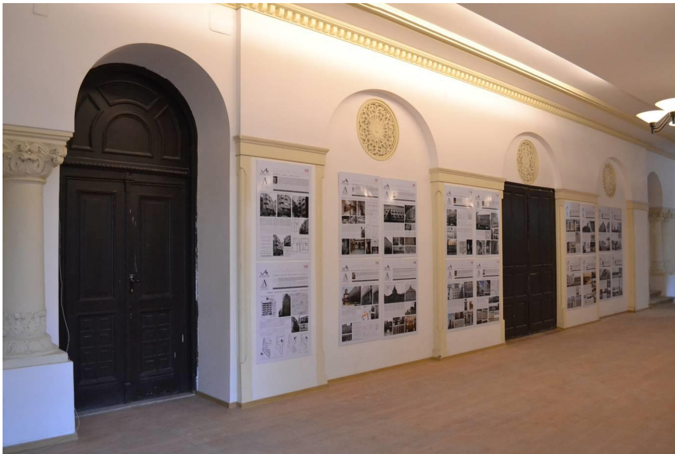
„Romanian architects, creators of cultural heritage” gallery, UAUIM